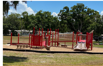
Ballast Point Elementary School $387k - Waterproofing, Security and Fire Alarm System, K-3 Playground Replacement