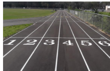
Greco Middle School $788k - Security System, Repaved Track, Court Replacement, Interior and Exterior Painting