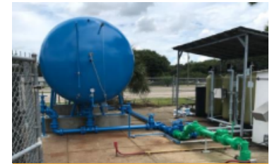
Durant High School $268k - Water Tank, Generator and Chiller Replacement